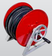
High pressure and Low pressure hose reel