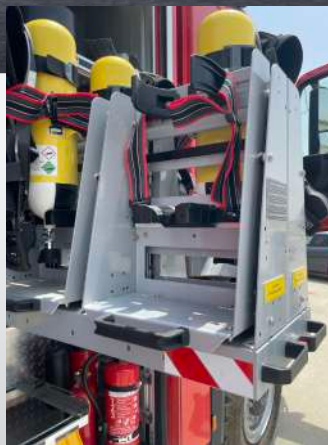
Slide out storage and equipment trays