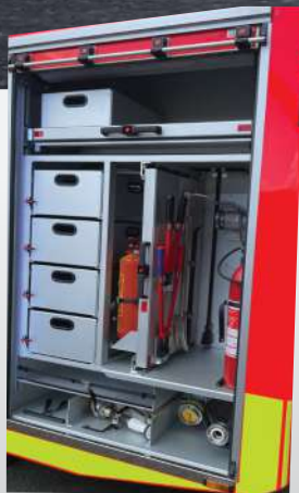
Full depth, Full height storage side compartments