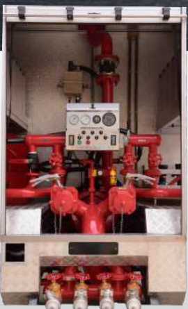
Full Access Control Panel with all controls ergonomically accessible [Optionally Pneumatic Actuated Controls]